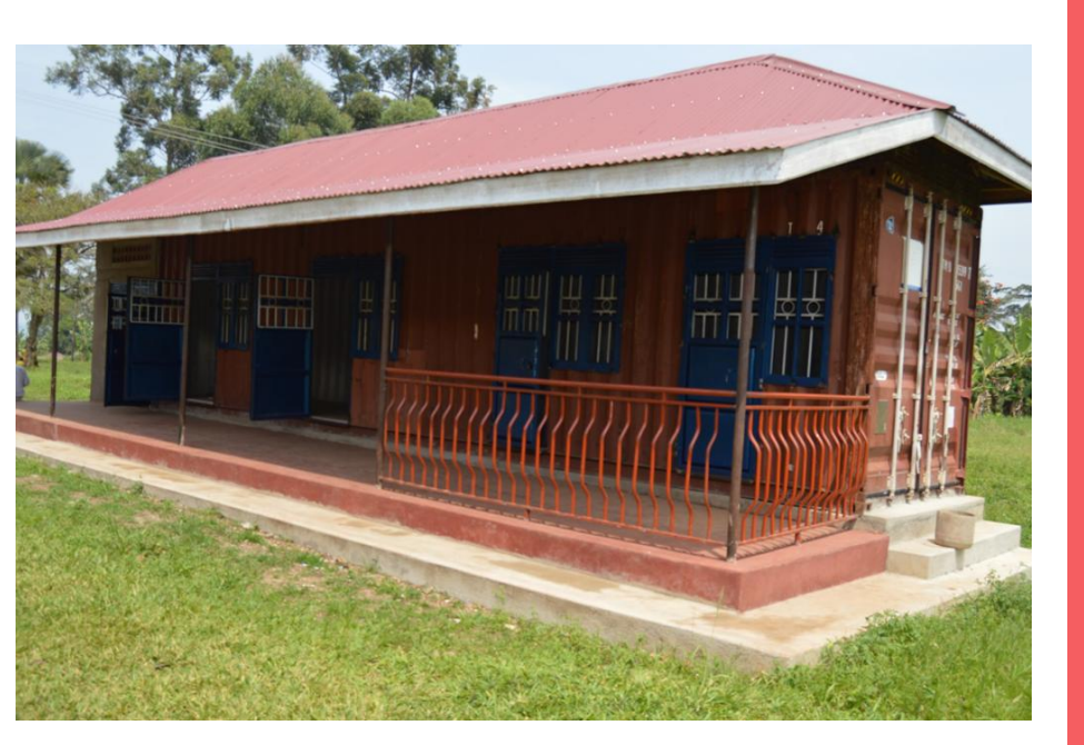
Windows and doors installed