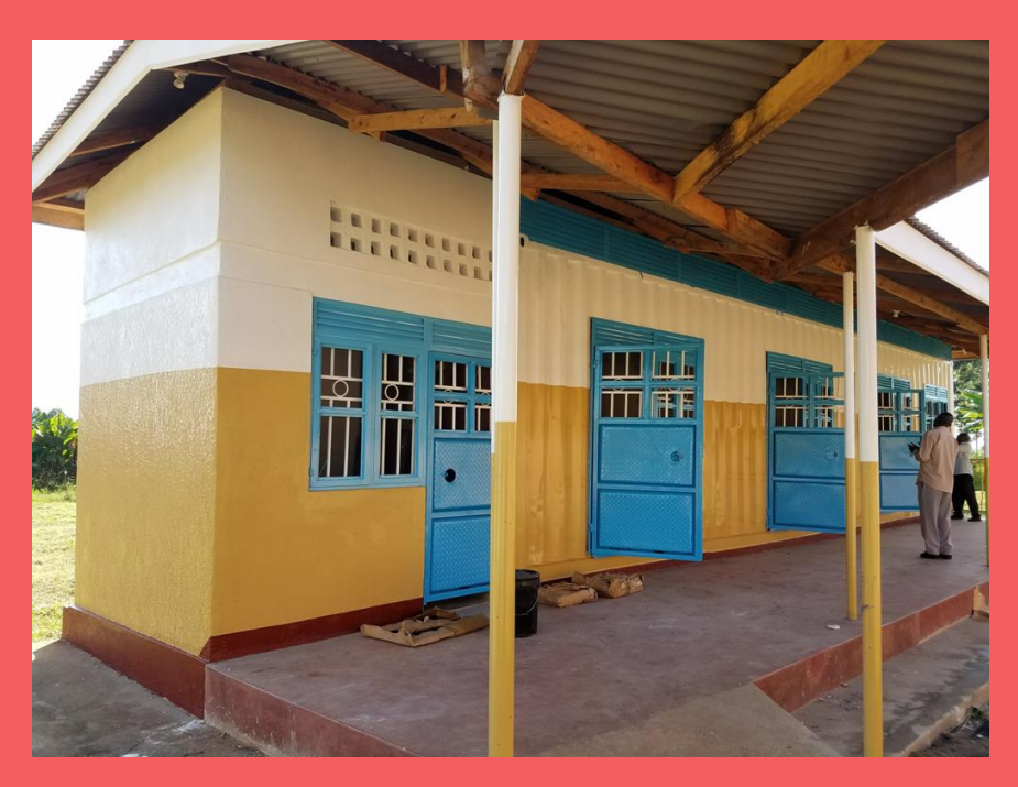
Side view of completed clinic