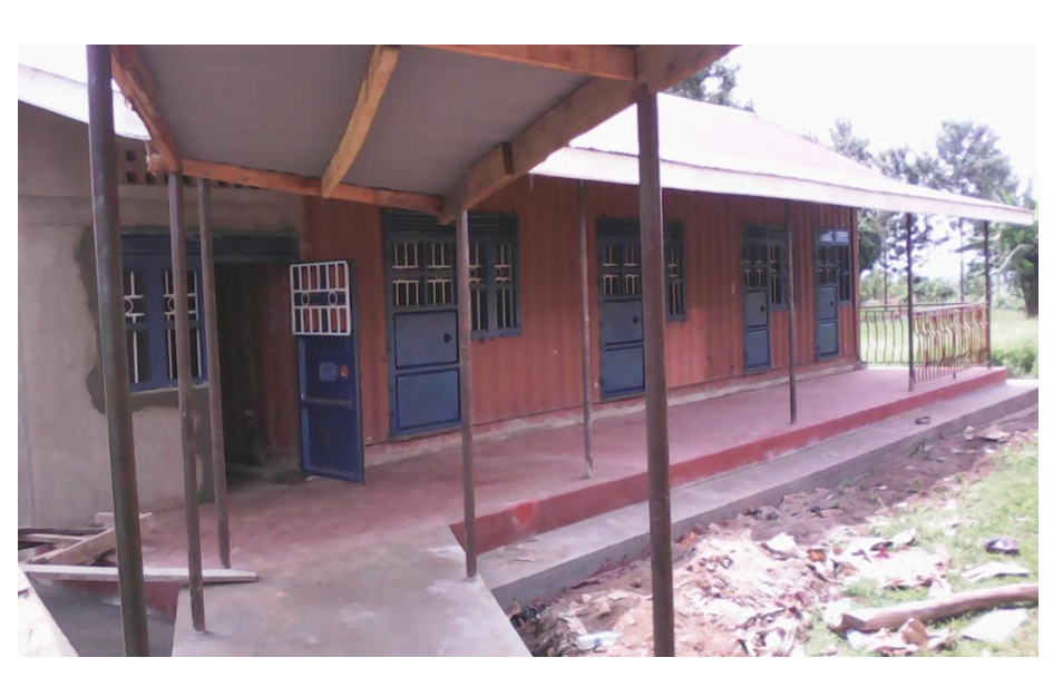
Side view after installation of windows and doors