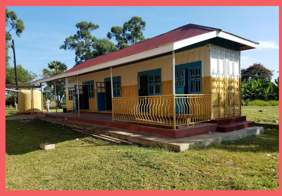
After painting with Uganda medical colors